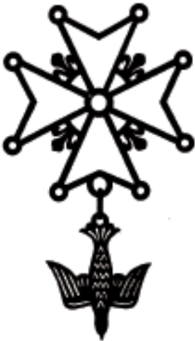
Huguenots wore this cross as a sign of their faith.

Stresses. Everybody's got 'em. School is going OK until you get huge assignments in every subject just before your term paper is due; you're getting along with mom and dad until that big clash over what time you have to be home on Saturday night. And so on. With a partner, act out a stressful situation—at home, school, work, anywhere—that makes you want to go “Ahhhhhhhhhhhhhhhh!” You can be funny or serious or both. Keep it short (a minute or less).