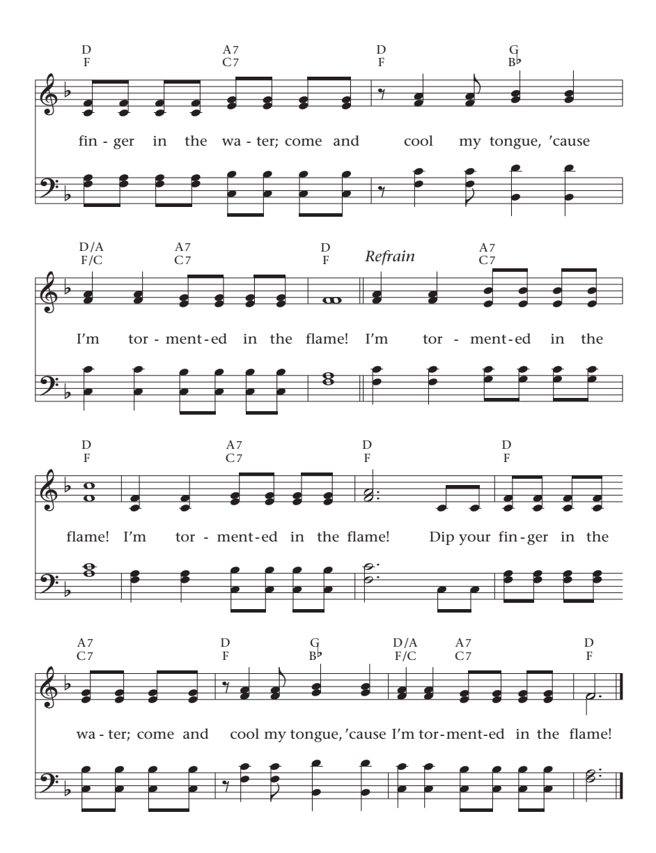
Some may wonder where the name "Divies" came from (st. 2). It originates from the Latin word "dives," meaning "rich man," as found in verse 16 of the Latin Vulgate. Consider the eighth notes carefully before selecting a tempo, or the tempo will likely be too fast. This spiritual would be a great a capella piece for a choir.