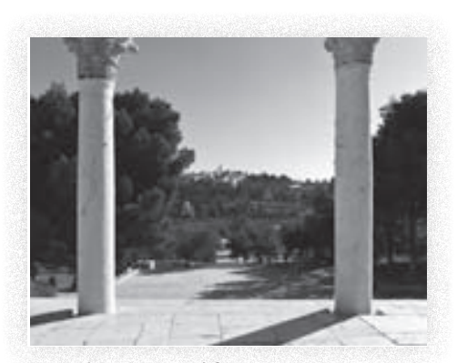
View of the Mount of Olives today as seen from the temple mount in Jerusalem.